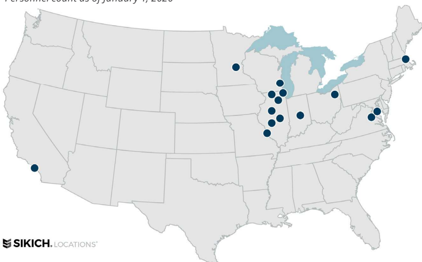
● SIKICH LOCATIONS*

2019 Revenue ..... $167.4M Total Partners ..... 100+ Total Personnel ..... 1,000+ Personnel count as of January 1, 2020